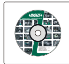
software CD (included)