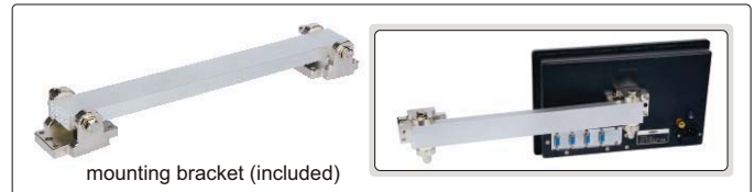
mounting bracket (included)