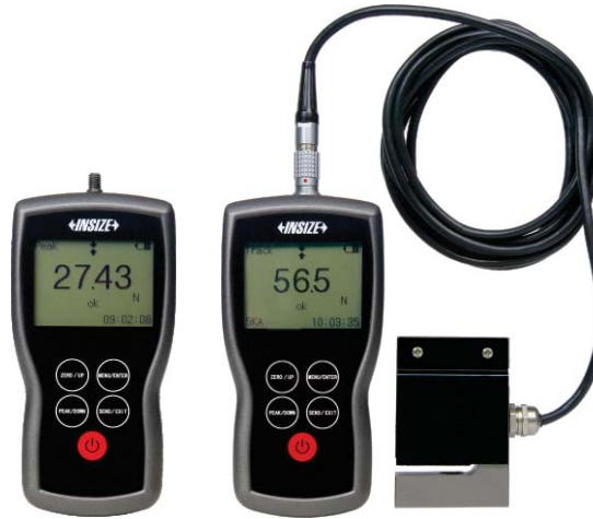
ISF-DF100A type A