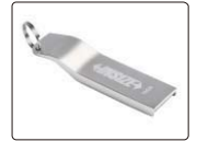
software flash disk (included)