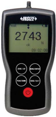
ISF-DF100A type A