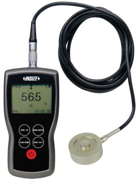
ISF-DF10KC type C