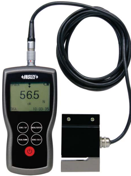
ISF-DF5KA type B