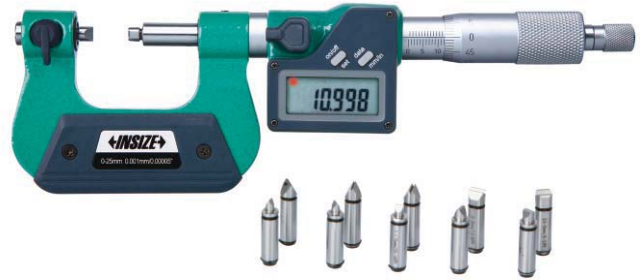
3581-S25 (measuring tips are included)