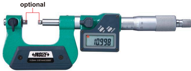
3581-25A (measuring tips are optional)